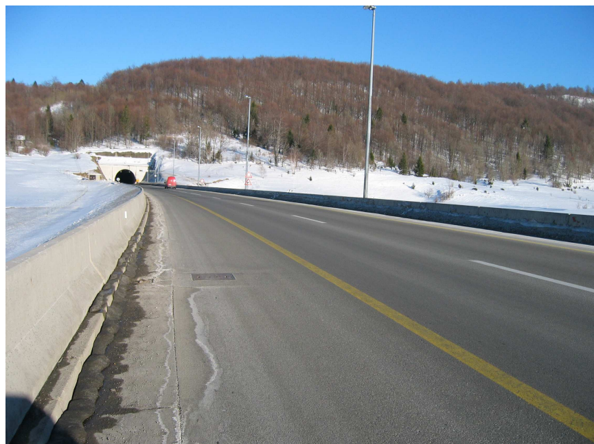
Figure 2.7 New semi motorway near Kupjak.