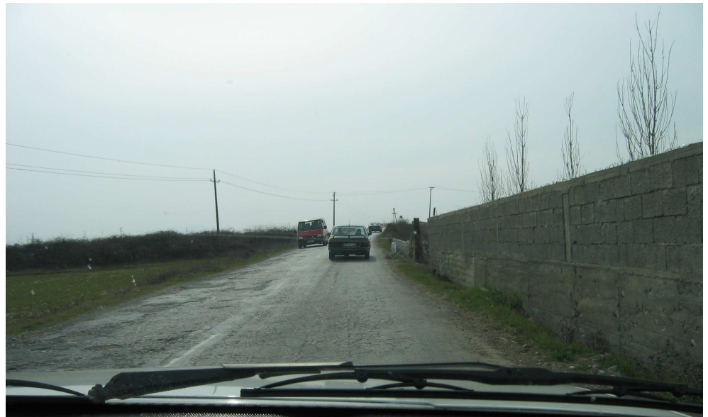
Figure 2.3 Typical road before upgrading.

Albania is using Italian standards for construction of new roads. As an example, instead of constructing ordinary motorways with grade separation they are building 4 lane roads with 1 m hard shoulder on each side and with level crossings.