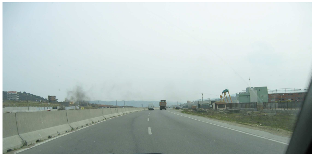
Figure 2.4 New "motorway" between Dures and Tirana.