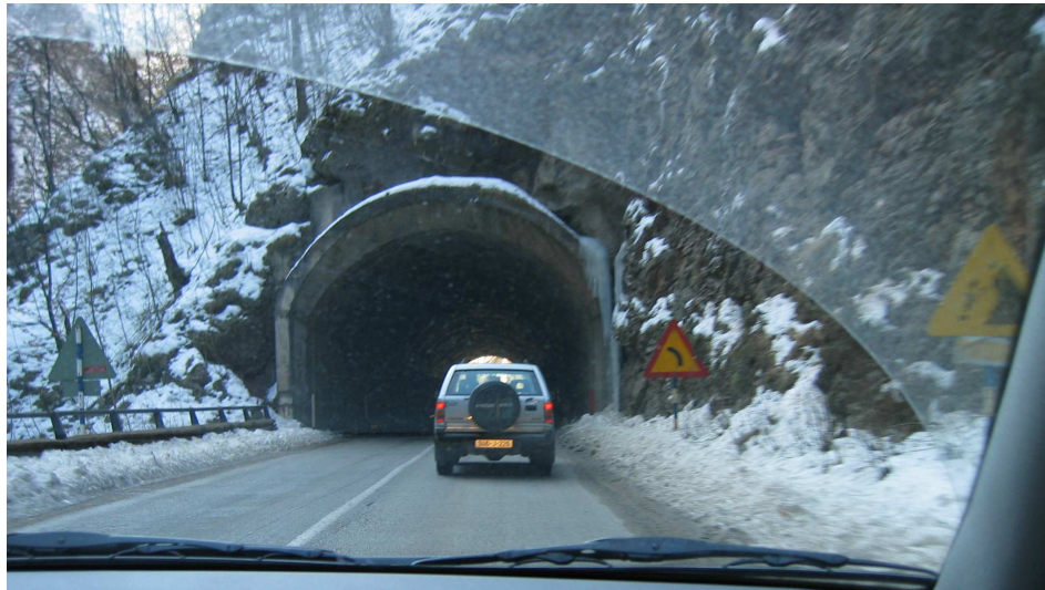
Figure 2.5 There is a need for rehabilitation and maintenance of some roads and tunnels and for protection against landslides.

Except for the motorway under construction near Sarajevo, no new roads have been constructed during recent years.