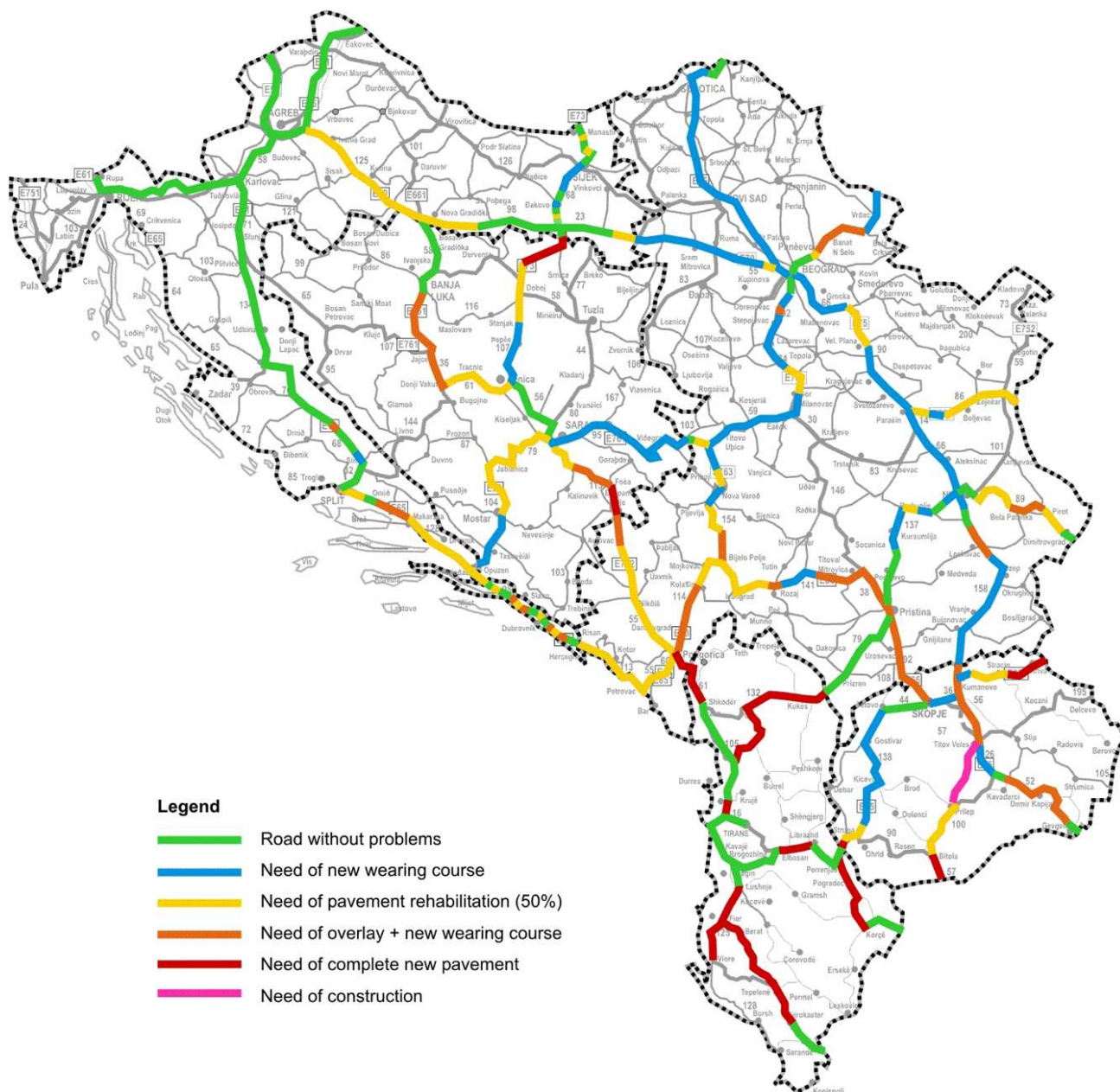
Figure 2.2 Road condition.