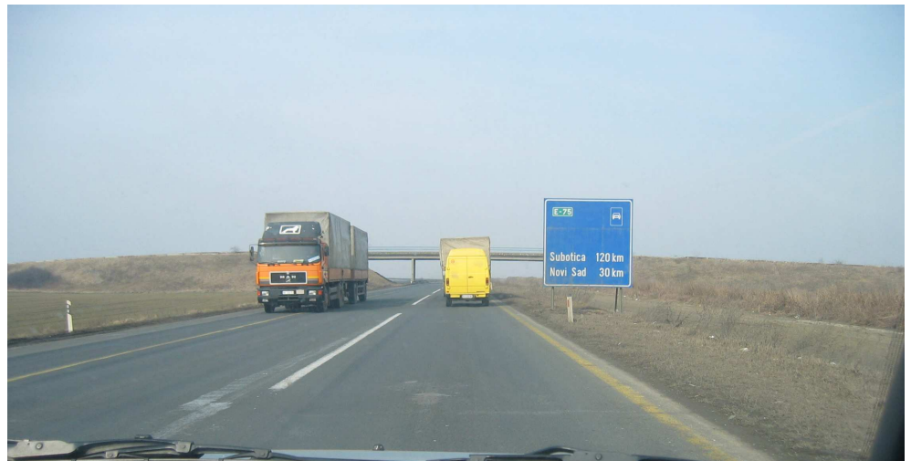
Figure 2.9 Earthwork for 4 lane motorway has begun on western/westerly side of Belgrade - Novi Sad road.