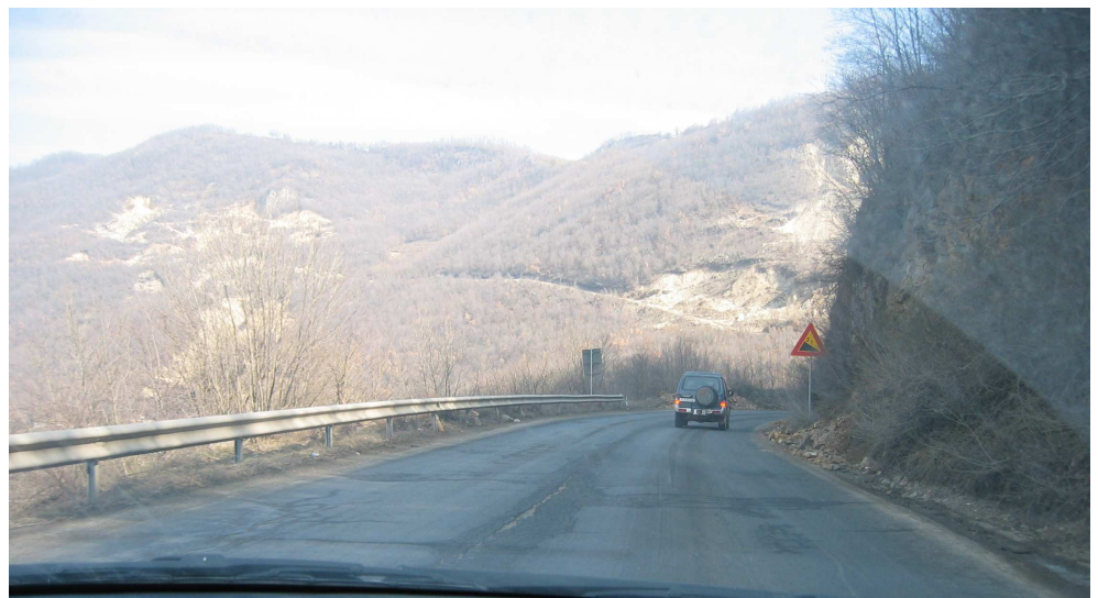
Figure 2.10 Road between Gabrica and Den Jankovic.

The pavement condition indicates a need for an overlay and new wearing course on almost half of the roads.