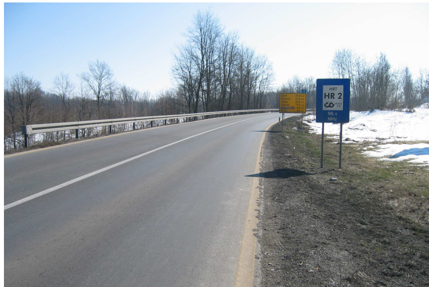
Figure 2.6 Condition of the road network is, in general, very good.