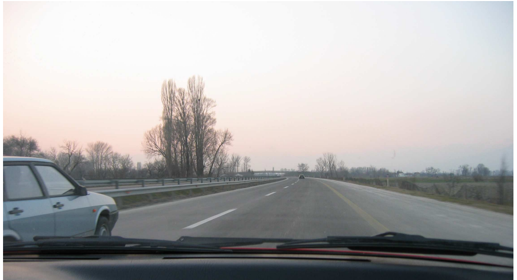
Figure 2.8 Typical motorway in FYRO Macedonia.

Existing traffic is low and the capacity of the majority of the roads is sufficient. However, there are a number of narrow roads with reduced road safety.