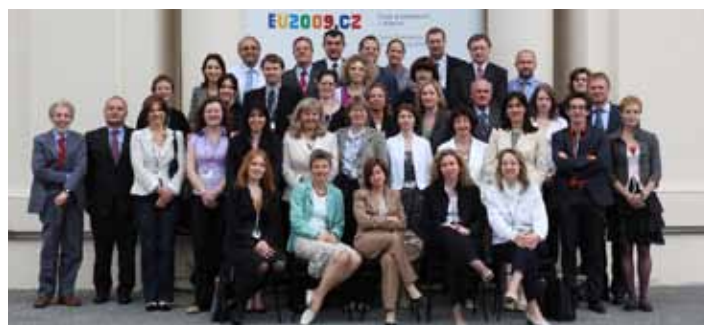
6 th Meeting of the Steering Platform on Research for the Western Balkan Countries, Liblice, Czech Republic

The Platform welcomed, in particular, the willingness to strengthen the cooperation at regional level under the auspices of the Regional Cooperation Council. The Platform is very supportive of the newly established Strategic Forum for International S&T Cooperation (SFIC) and encourages the Western Balkan countries to nominate their delegates and participate actively in the work of the Forum.