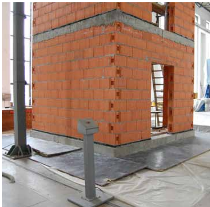
Shaking Table at IZIIS

In addition to direct cooperation of the Institute with universities, institutions and the economic sector of the country, within the framework of the above mentioned activities a permanent and intensive international cooperation has been developed and maintained. Such international cooperation with universities, scientific institutions and centres worldwide is a prerequisite for more efficient and more complex scientific research within the Institute.