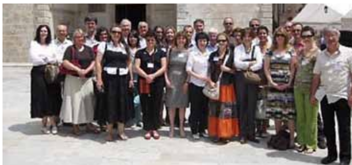
Participants of the Regional Workshop on the Evaluation of Research and Universities in Kotor

One issue should be particularly pointed out for the readers of WBC-INCO.NET journal – the WBC-INCO.NET mailing list was the main tool for inviting participants to the workshop. The project team received more than 200 applications in a few days, which created a great pool to select the most appropriate participants.