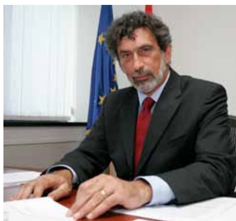
Radovan Fuchs was appointed Minister for Science, Education and Sport

Furthermore, Fuchs is a member of the Steering Platform on Research for the WBCs.