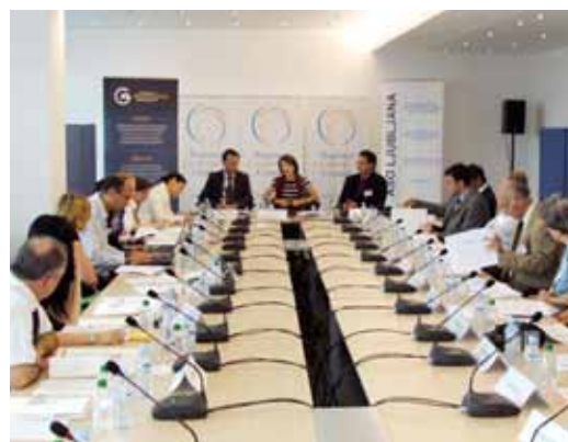
Participants at the ICT Workshop in Sarajevo

A follow-up workshop is planned for early November 2009 to develop concrete regional SEE project initiatives in this field.