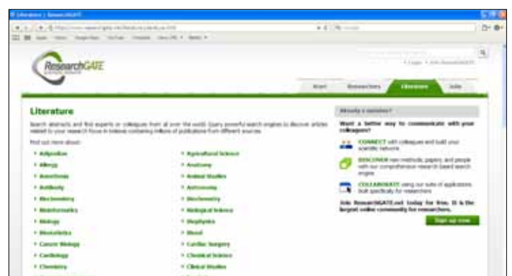
Self-Archiving Repository at ResearchGATE

LINK Open the ResearchGATE ■ http://www.wbc-inco.net/object/link/65218.html