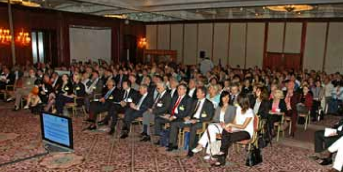
Audience at the FP7 Research Conference in Belgrade

On June 29, 2009 the Joint Research Centre (JRC), the Commission's Research Directorate General and the Serbian Ministry of Science and Technological Development jointly organised a high-level conference in Belgrade entitled "Towards Serbia's Integration into the European Research Area".