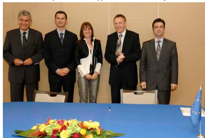
Group photo (from left to right): Volkan Bozkir, Permanent Representative of Turkey to the EU; Dragan Primorac, Croatian Minister for Science, Education and Sports; Ana Pešikan, Serbian Minister of Science; Janez Potočnik and Sulejman Rushiti, Minister of Education and Science of FYR of Macedonia.

"Associated status" allows these countries (as well as Turkey, which signed a similar Memorandum on June 1) to participate in all calls for proposals and compete on an equal footing with the EU Member States for research co-operation and support actions funded by FP7.