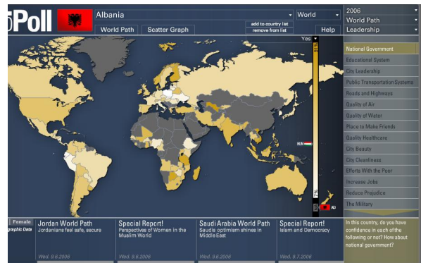
Illustration of the web-based portal ►

Immediate access to the voice of the Balkan people will be available through membership of a state-of-the-art, web-based portal. This key to the Balkans will allow members to perform detailed searches, track key indicators, compare data, and always have the latest available information on what the citizens of South-Eastern Europe are thinking and feeling.