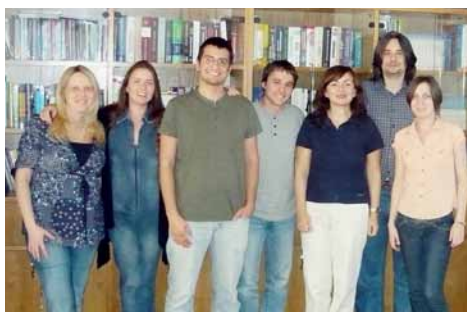
Staff members of ICEIM.

In the past two decades, ICEIM's permanent researches have published more than 450 papers in international scientific journals, as well as a large number of contributions in monographs and proceedings of national and international conferences. Up to now, 75 research projects have been realised in the Center, by numerous national and international collaborators.