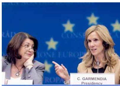
Research Commissioner Máire Geoghegan-Quinn (left) and Spanish Minister for Science and Innovation Christina Garmendia