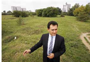
Božidar Đelić called on architects to participate in the architectural competition.

Deputy Prime Minister and Minister of Science and Technological Development Božidar Đelić called on architects from around the globe to participate in the international architectural competition for the future building of the Centre for the Promotion of Science, which was announced on September 15, 2010. Đelić said that this competition would present an unusual facility that could become one of the landmarks of Belgrade, as well as a venue, where elementary school children and students, their parents and teachers had the opportunity to learn about science and technology.