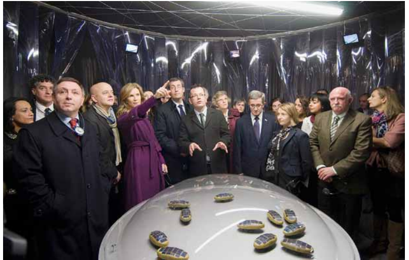
Informal Competitiveness Council at San Sebastián, Spain

Through this key area, the Spanish Presidency of the EU aimed to emphasise the need for science and innovation to address major challenges, starting with the economic crisis. This was the main topic of the San Sebastián/Donostia Declaration entitled "Science for recovery and economic growth: here and now" and endorsed by all EU Member States. Important steps have been taken towards reducing bureaucracy within European R&D programmes and promoting the adoption of a set of conclusions on this matter at the Council meeting in May – steps, which will be taken up by the next presidency.