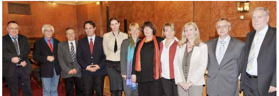
On September 29, ASO Ljubljana celebrated its 20 th anniversary of existence at the University of Ljubljana.

On September 29, ASO Ljubljana celebrated its 20 th anniversary of existence at the University of Ljubljana with high-level representatives of the Austrian and Slovenian Ministries of Science expressing their great satisfaction with the past and present excellent level of bilateral and multilateral scientific cooperation between both countries. They reiterated the will to continue the successful way of joint efforts towards the promotion of an integration of WBCs into the European Research Area.