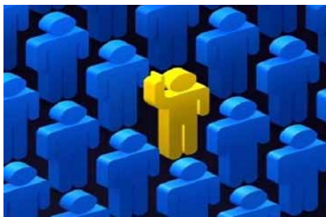
Innovation is one of the focuses of the new European Commission.

More attention and support actions are required to ensure the chain from “Good Ideas to the Market” and in doing so, shift to an innovation market, both for products and services. This requires better framework conditions and access to capital to make the valorisation of research possible and quicker. In this context, the importance of an EU-wide patent and access to venture capital are once more underlined. The state-aid rules on research and technological development should also be reviewed so as to clarify which innovation projects can be supported. The efforts needed to facilitate the commercialisation of research efforts have been clearly identified in the section on “Creating a single innovation market”. Too often the scientific knowledge is available, but either unknown or its valorisation is hampered. For this, the EC calls for more harmonised rules for product