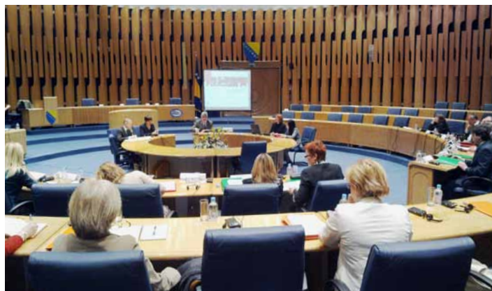
Participants at the International R&D Financing Conference in Sarajevo in late spring.

MSTRS and the Serbian Ministry of Science and Technological Development signed a Memorandum of scientific and technological cooperation, which should foster the development of joint research projects, joint research centres, as well as the coordination of activities in the field of scientific national and international programmes.