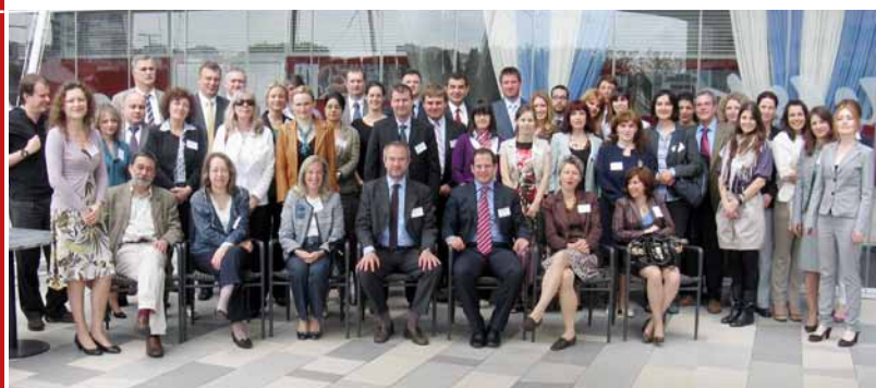
8 th Meeting of the Steering Platform, Belgrade, Serbia