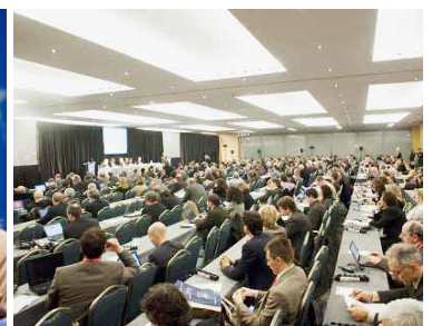
Audience at the European Conference on Research Infrastructures