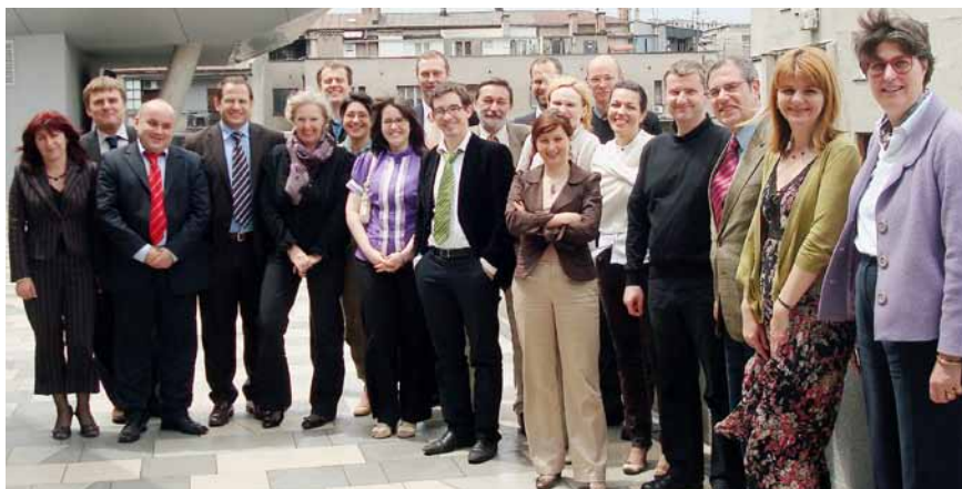
The Steering Board of SEE-ERA.NET PLUS

SEE-ERA.NET PLUS supports the integration of bilateral RTD initiatives into multilateral, jointly agreed activities with an impact on strategic priorities at European level and makes more resources available than it would have been possible via bilateral cooperation agreements. Strengthening research communities in new Member States and WBCs and preparing them for a participation in FP7 is of key importance.