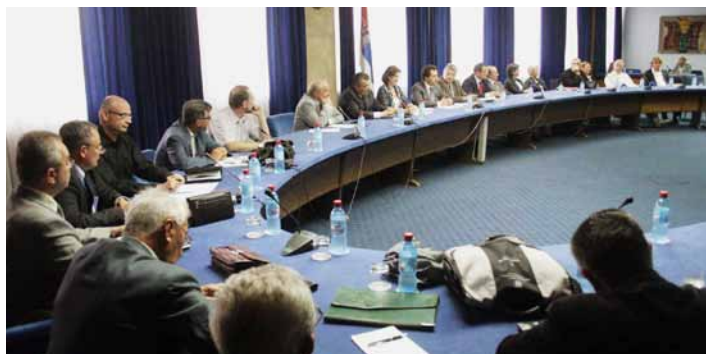
Participants in the meeting on the public tender for the positions of directors.

The Minister of Science and Technological Development Božidar Đelić met with the presidents of the boards of scientific organisations to talk about the conditions of the ongoing public competition for the positions of directors in these institutions. Đelić said that in the following month, a public tender for the positions of directors of more than 40 research institutions in the country would be carried out, and added that the scientific community “seeked” for leaders in science – the most ambitious, most professional and talented people would be selected in a democratic ambience.