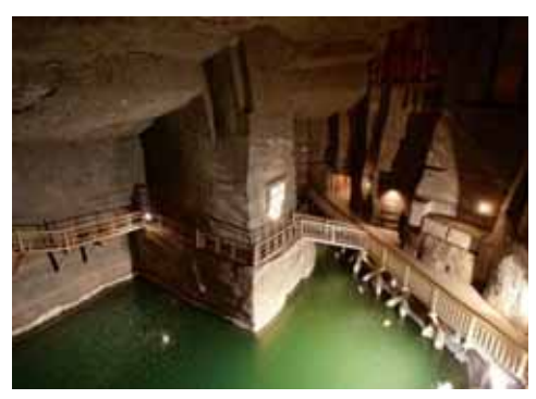
Wieliczka Salt Mine