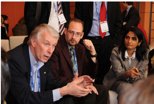
Nobel Laureate Richard J. Roberts

Richard Roberts, Nobel Laureate, speaker in 2009: “I especially enjoyed my meeting with the students”