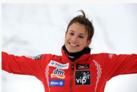
Ana Jelušić , Croatian ski representative, now employed by the International Olympic Committee was one of first students of the Sports Academy.